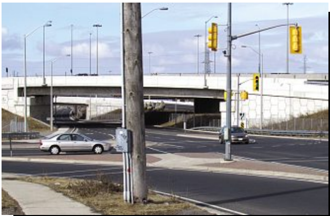
Here's the results

I will continue to work with our municipal and regional representatives to stimulate investment in jobs and boost development with appropriate transit, infrastructure and community facilities.