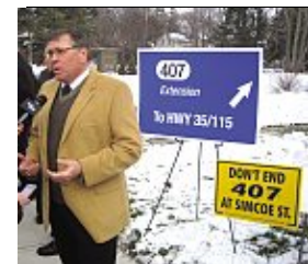
Here's the announcement

The eastern development of Highway 407 represents the largest single economic stimulus for Oshawa and the Region of Durham. I have always been a big supporter of the Highway 407 East extension all the way through our region and I recognize the huge economic stimulus and other positive aspects that it will bring to our community.