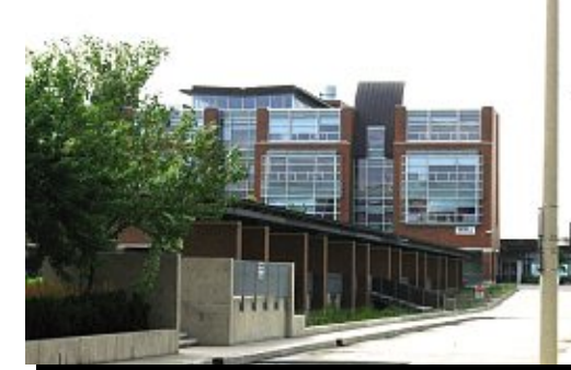
Here's the results

UOIT recently opened its new downtown Oshawa campus at the refurbished Regent Theatre. Along with the opening of its faculty of education on Simcoe Street and the restoration of the former Alger Press building which will open in September housing classrooms, study space, student services, research space and a small café, UOIT has significantly enhanced the atmosphere of downtown Oshawa.