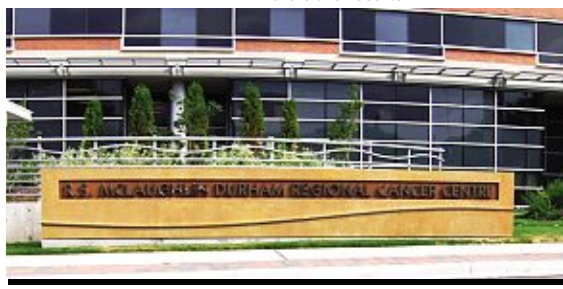
Here's the results