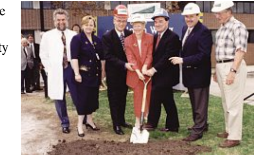
Here's the announcement

The residents of Oshawa deserve to have this type of world class facility at their service.