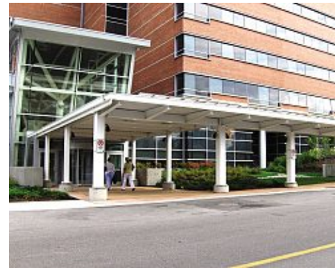
Here's the results