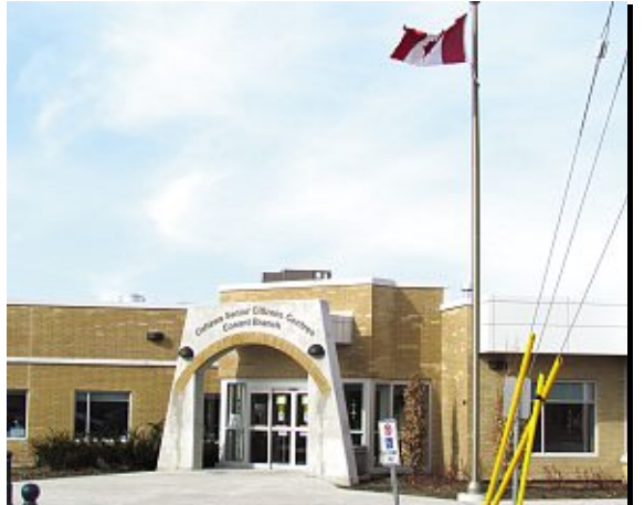
Here's the results

I have been able to work with the Oshawa Community Health Centre on many occasions and admire the effort and unique, innovative care this organization provides to our community. I have also had the opportunity to support and assist the dedicated individuals of the Oshawa Senior Citizens Centres on numerous undertakings and I am proud of this exciting new development in this area of the city.