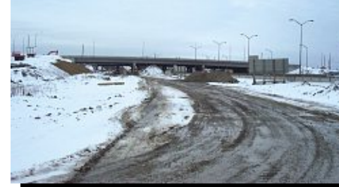
Here's the announcement

Development for a brand new Stevenson Road interchange began many years ago with the appropriate planning and procurement of funding.