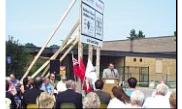
Here's the announcement

I was pleased to announce millions in investment for a new branch of the Oshawa Senior Citizens Centre's along with Oshawa Community Health Centre's new facility, the Dr. Bryce A. Brown Wellness Centre.