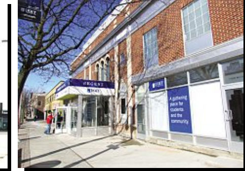
Here's the results