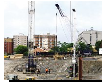
Here's the announcement

As former Parliamentary Assistant to the Minister of Transportation I was responsible for facilitating the current Highway 407 development into the Region of Durham. I worked with ministry officials, municipalities and regional representatives to bring this to fruition. I will continue to work with all officials in the same manner to ensure the rapid construction of Highway 407 through our community and expedite its completion to Highway 115/35 in one phase.