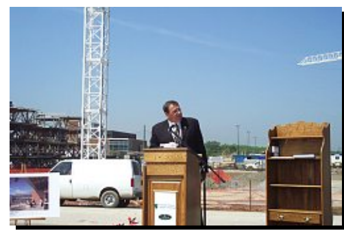
Here's the announcement

I am proud to have contributed to the development of Ontario's first public university in 40 years. The University of Ontario Institute of Technology right here in Oshawa has already achieved tremendous prominence in its brief history and an exciting future lies ahead. Full-time enrollment is currently at 7000 undergraduate students and another 500 in graduate studies for the 2010/11 year with future development and expansion on the horizon.